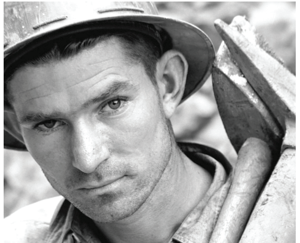
Tennessee Valley Authority was a government program that hired workers during the Great Depression.